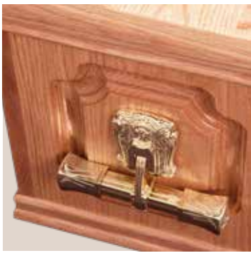
Butt joint ends