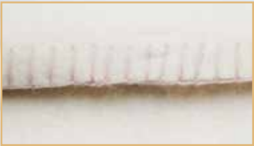
Natural stitch (standard)