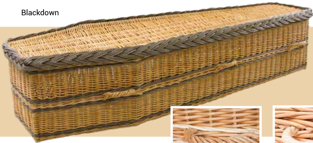
Handle Options -