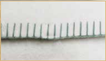
Sage stitch (optional)