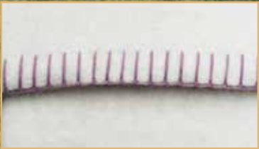
Heather stitch (optional)